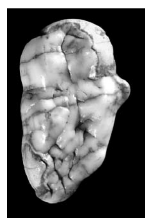
Figure 2. Ursus arctos : Second upper molar, occlusal view (photograph by P. Jugie, MNP, les Eyzies, France).

The dimensions of the first phalanx, which bears cut marks, are shown in tab. 3 (the height cannot be measured because of heavy erosion of the edges). It is difficult to determine the species on the basis of dimensions of the first phalanx. The data provided by TORRES (1984) overlap for Ursus spelaeus and Ursus arctos , and our specimen stands in the overlapping area. This specimen seems to be rather slender and may therefore belong to a brown bear.