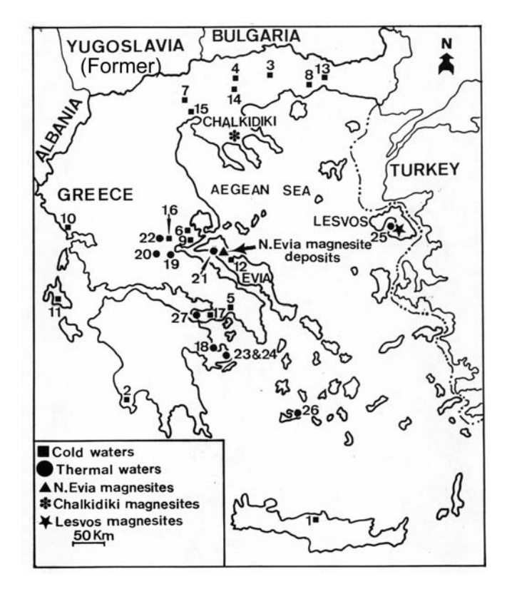
Figure 1. Map of Greece showing the magnesite deposits of Evia, Lesvos and Chalkidiki plus sampling locations of the reported cold meteoric waters and thermal waters.

magnesite deposits from other countries. The origin of carbon and the type of the waters (aqueous fluids) involved are inferred from stable isotopes data.