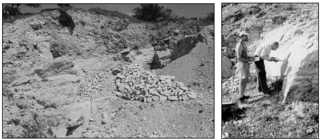
Figure 3, 4. Open limestone quarry from Slava Rusa, when carried out "in situ" tests

By comparing the results obtained for the compression strength with those subsequently determined by direct tests, the validity of the calculus relation was proved, the obtained mechanical resistances registering differences that can be included in the error tolerance limit. The correctness of the values of the longitudinal propagation velocity determined by the surface technique is verified, by comparing these values with the values of the propagation velocity measured with the direct transmission technique, insignificant differences existing between the two values