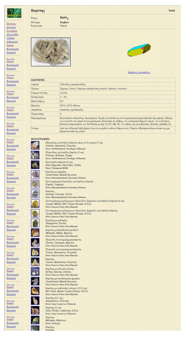
Fig. 2. Page of the web material of the course "Mineralogy" referring to the mineral Baryte [1].