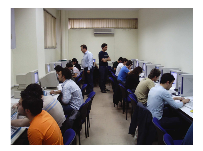
Fig. 4. Examination in the computer room of the Geology Dept. Univ. Thessaloniki.

The ultimate goal is to create realistic simulations of actual field and laboratory conditions. An alternative is to show how the measurements are taken using visual aids and next give the data that could had been produced. The exercise is then entirely based on these data. The tools needed for any manipulation are also provided through the web. The students should proceed to various actions and produce an essay on the results. The essays are submitted through the web and the corrected versions are returned to their personal email addresses, if they have such. If they do not have private internet access, they can use the working positions of the Departments computer room. It is evident that the second approach is much more convenient by any means. Nevertheless, is not as effective as is the first one from the educational point of view.